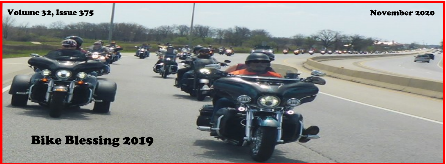
Bike Blessing 2019