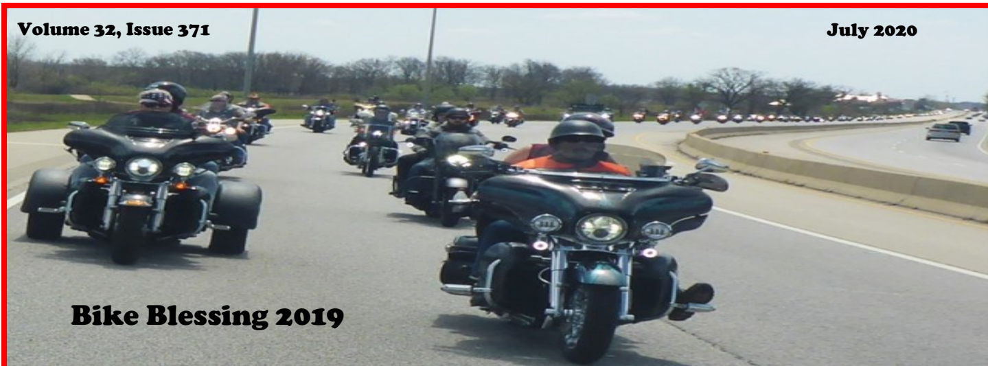
Bike Blessing 2019