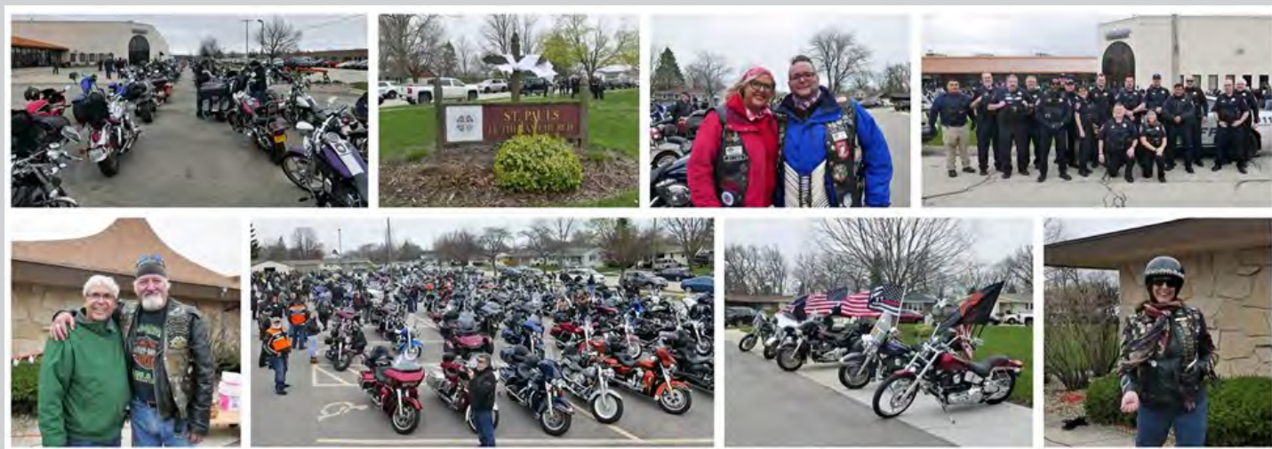
Ride for Freedom: