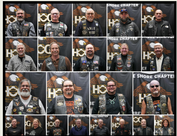
2020 LSHOG Road Captains