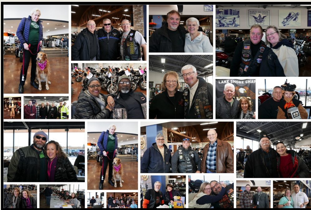
Annual Membership Sign-Up 2020