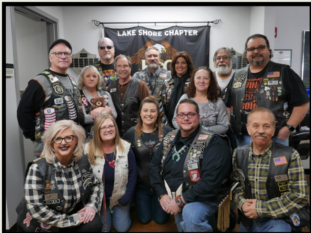
2020 LSHOG Officers